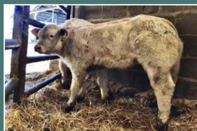
Progeny of Orateur