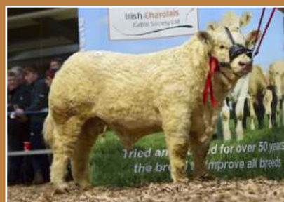
Progeny of Virtuose