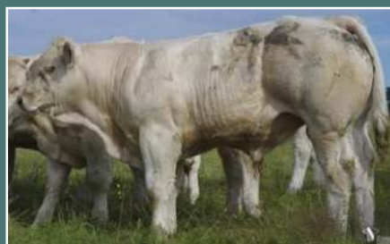
Progeny of Japon SC