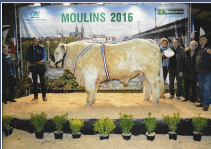
Jingle, half-brother to Ocelot