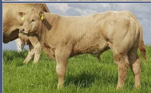
Progeny of Knockmoyale Loki