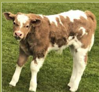
Pierre bull x Limousin dam 1 week old