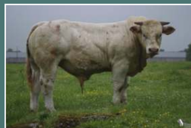
Grifondor Son in France