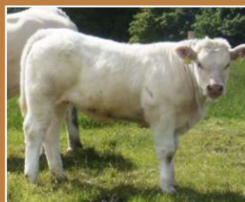
Progeny of Uni