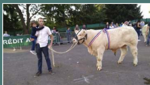
Progeny of Diplo GIR