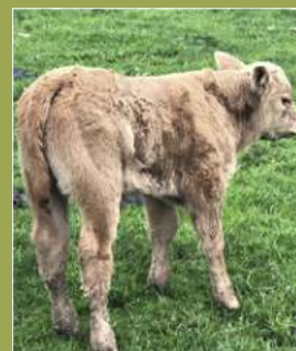
Pierre bull x Limousin dam 1 week old