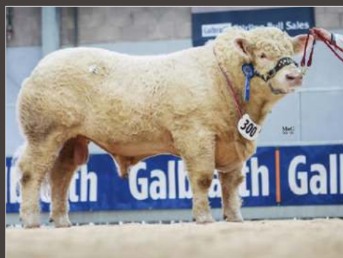
Son Burradon Olaf 10,000 Guineas, Stirling, Feb 2020