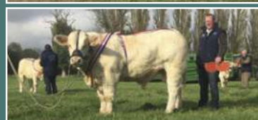
Progeny of Nevers