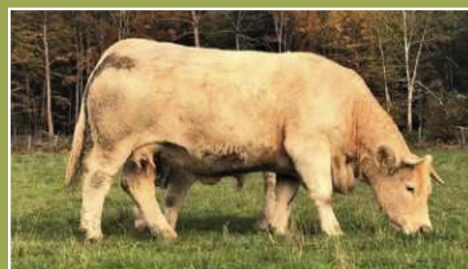
Insoumise – Rubis' dam