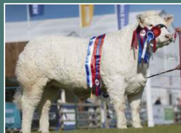
Drumshane Mademoiselle, Dam of Bostonia Ringo