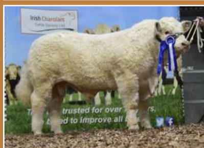
Progeny of Vosgien VF