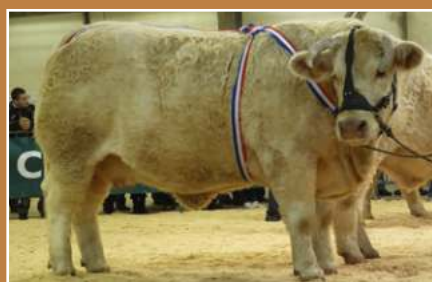
Ocelo as a young bull, and his dam Brésilienne