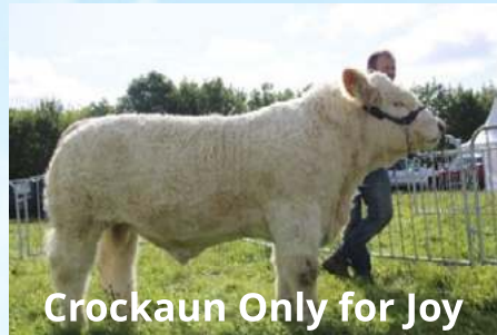
Crockaun Only for Joy