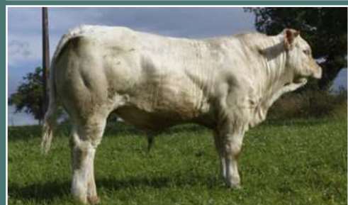
Progeny in France