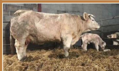
Progeny of Horace in France