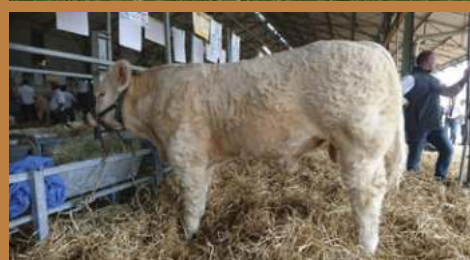
I Love You, the sire of Neptune, and Neptune himself as a calf