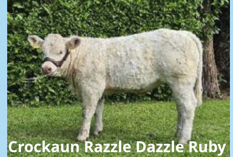
Crockaun Razzle Dazzle Ruby