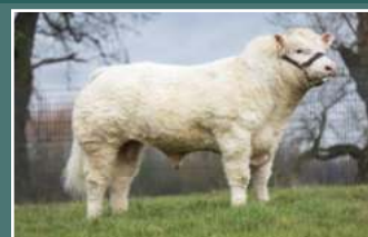
Whitecliffe James, Sire of Piper