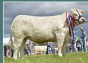
Goldstar Haidi, dam of Goldstar Othello