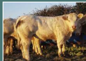
Heifer calf sired by Goldstar Othello