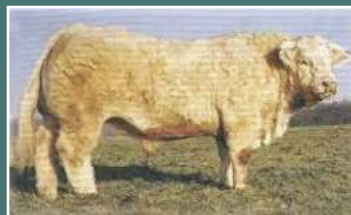
Hermes, Sire of Bostonia Ringo