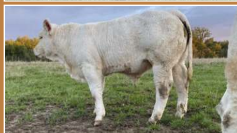
Progeny of Magicien in France