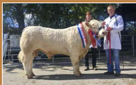
Progeny of Glasgow