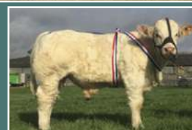
Hatenon Progeny in France