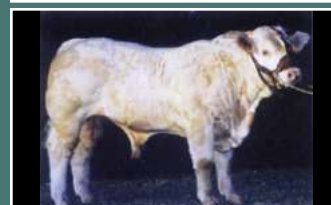
Pirate, Sire of Pipers Dam