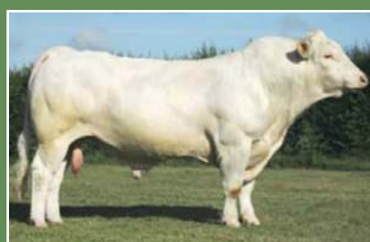
Epernay : Sire of Omega