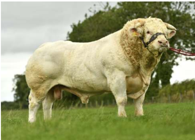
BALLYM MYLOVE Senior Stockbull