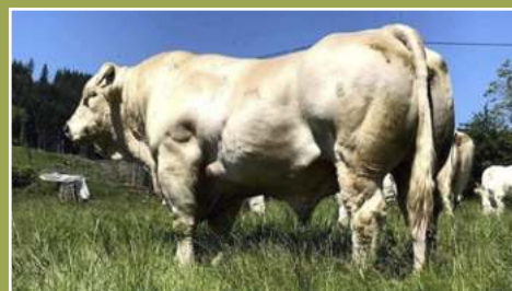
Laurier – Rubis' sire