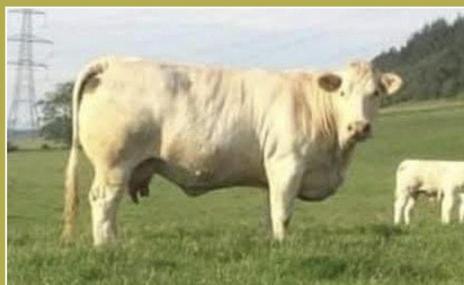
Thrunton Gazelle – Officers Dam. A super Balmyle Dickler cow