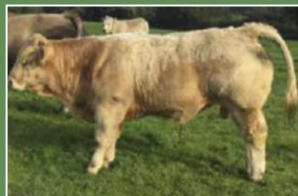
Progeny of Lapon