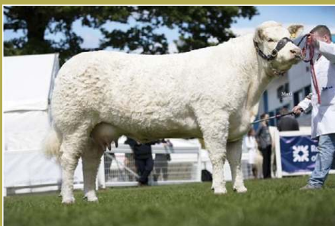
Battleford Lola, Panama's Sister pictured at the RHS, record priced NI Female and Scottish Charolais Champion of Champions 2018