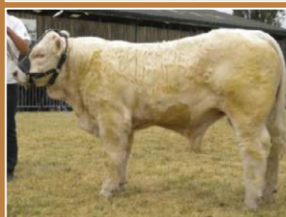
Progeny of Berry Mic in France