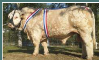
Forbant, Sire of Jingle