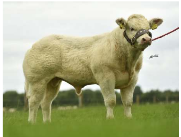
BALLYM ROYALE Son of BALLYM MYLOVE

BALLYM Charolais have been breeding Top Quality Pedigree Charolais since 1996.