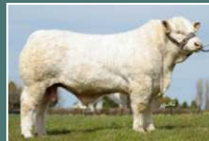
Goldstar Echo GHX