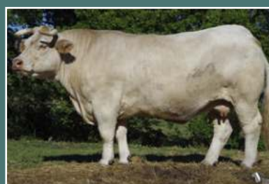
Dam of Helios