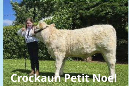
Crockaun Petit Noel