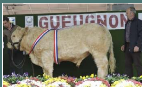
Progeny of Horace JD