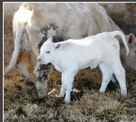
Musketeer pb bull calf, bred by Fintan Young, Dunleer, Co Louth