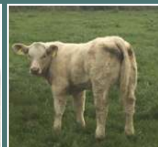
Maternal Sister to Ringo