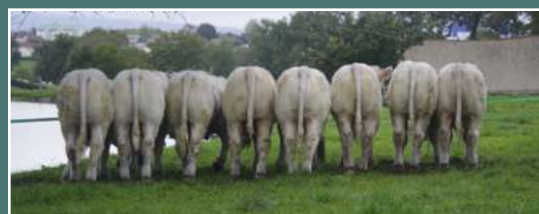
Group of Ocean Progeny