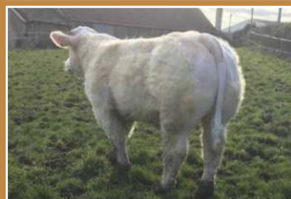
Military and a son of his in France