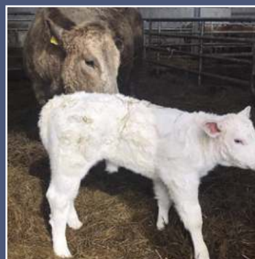
Progeny of Bud Orpheus