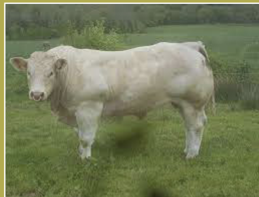
Typical Blelack Immaculate son displaying width and muscle