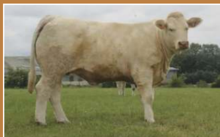
Progeny in France