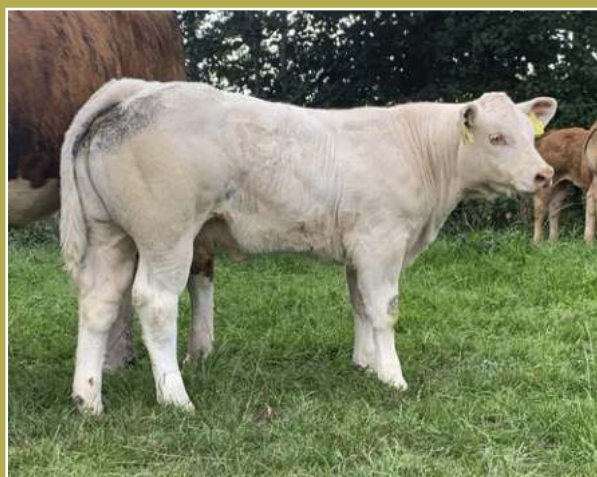
Nero daughter pictured at 10 weeks, bred by Bartley Finnegan